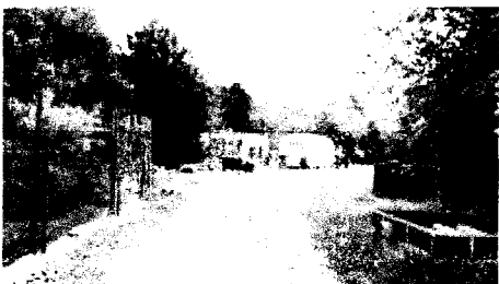
Footpath44 Caravan_Park.jpg 532K