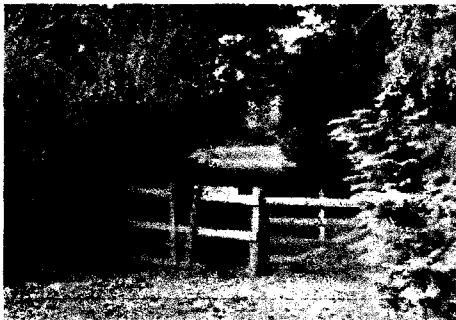
Footpath44 Burycroft_gate_and_style.jpg 162K