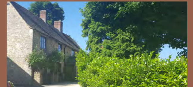
FIG 27 HEDGEROW BOUNDARIES