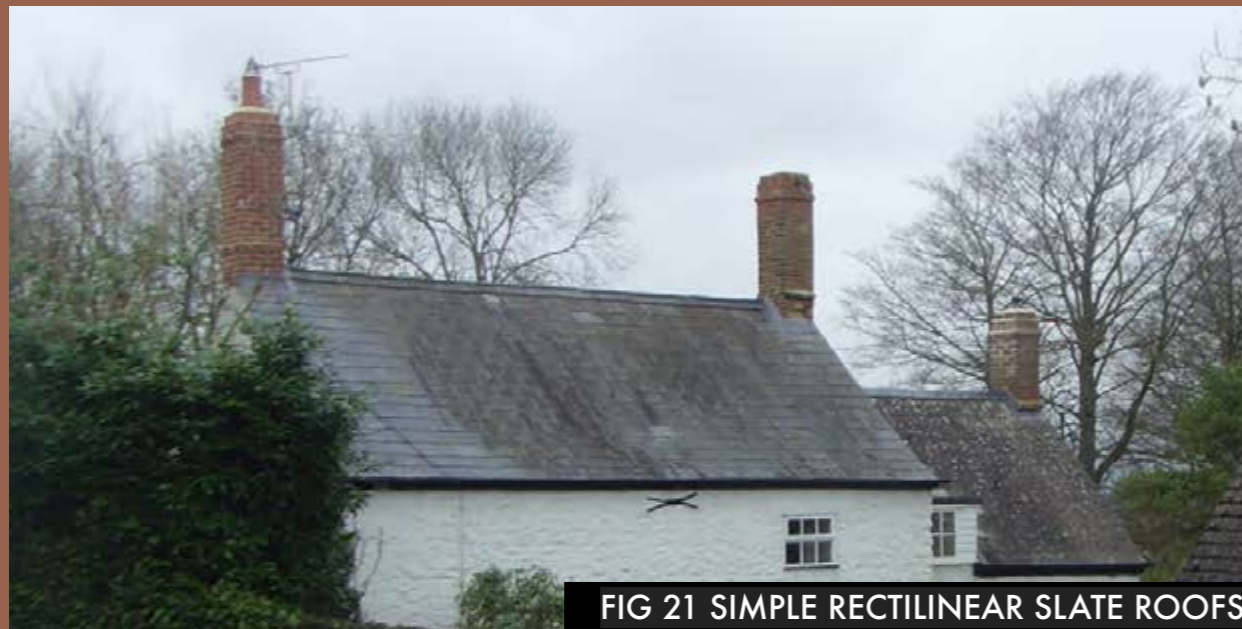
FIG 21 SIMPLE RECTILINEAR SLATE ROOFS

Where rooflights and or PV/ solar panels are proposed, they should where possible be positioned on non-obtrusive roof slopes. They should be minimised in size and number. In listed and pre 1920 buildings 'conservation' type design principles should be used.