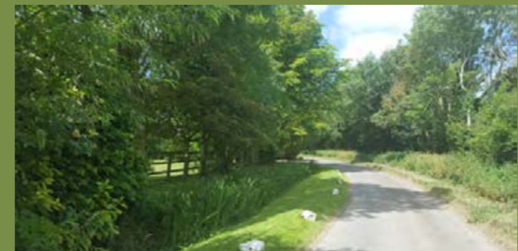
FIG 10 ROADSIDE STREAM & VERGE

3.15. The BENP area was first inhabited and developed as a result of the prevalence and availability of water, through natural ridge based springs and unique ridge topped valleys. A key feature of the Lower Village is the capture of that spring water in the roadside streams along Front and Back Lane (FIGS 10 & 11). Also the tributary of the Bydemill Brook that flows over the scarp to the Thames creates marshy lush grassland in its valley, bisecting the area and providing great habitats for a myriad of species. The rate of flow through the water course varies throughout the year but is always present. In the Lower Village Conservation Area the constant sound of water has become an established characteristic. Grass verges and soft road edges are a feature of the Lower Village stream and they are often manifested as roadside ditches. These are not robust and need constant attention to keep them flowing and to stop minor floods.