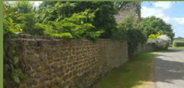
FIG 9 STONE WALL & GRASS VERGE