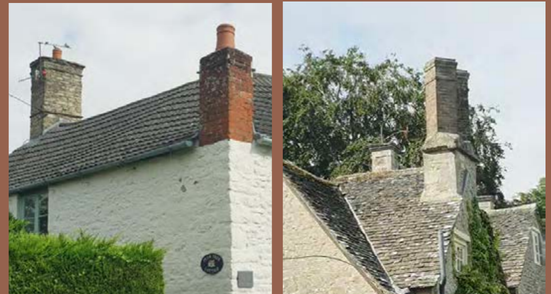
FIG 22 BRICK AND STONE CHIMNEYS

4.13. Although chimneys are an important feature for historic and less recent buildings in the area they are mostly square massed and redbrick even on the thatched buildings. Some of the old 'farm' houses have feature chimneys of Cotswold stone. New development tends not to use chimneys except in a decorative function. Although there is an increasing popularity for wood-burning stoves of late. Where this is the case they should follow the standard design in existence in the area.