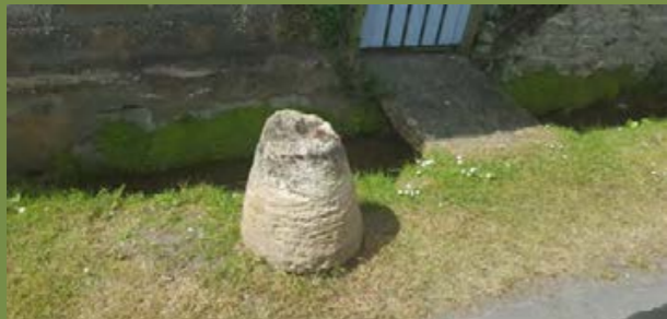
FIG 8 STREAM & STADDLE STONE

Within the built form of the BENP, boundary features should be retained or sympathetic to those already extant. The use of native and local species in hedgerows, trees, grass verges and other soft landscaping appropriate to the locality and situation will be encouraged, as will the planting of new trees in new developments.