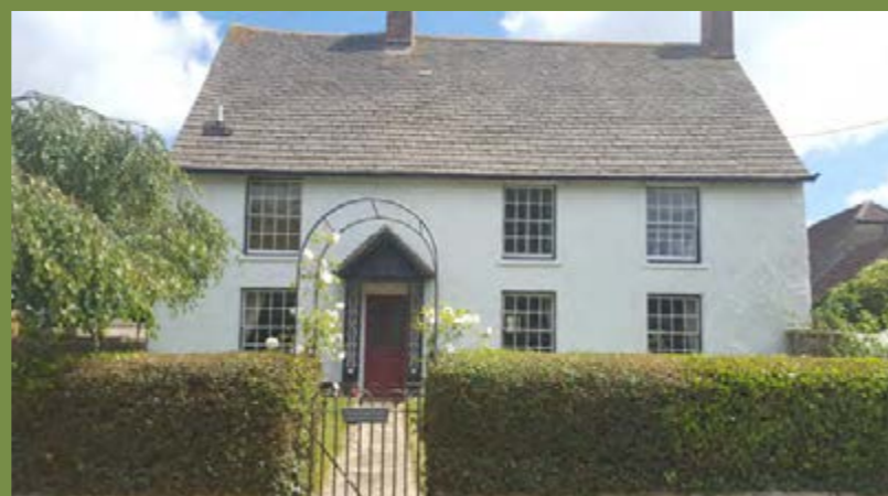
FIG 4 FOWLERS FARM