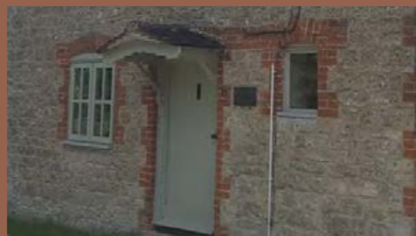
FIG 25 SIMPLE PORCH