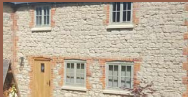
FIG 24 SIMPLE WINDOWS