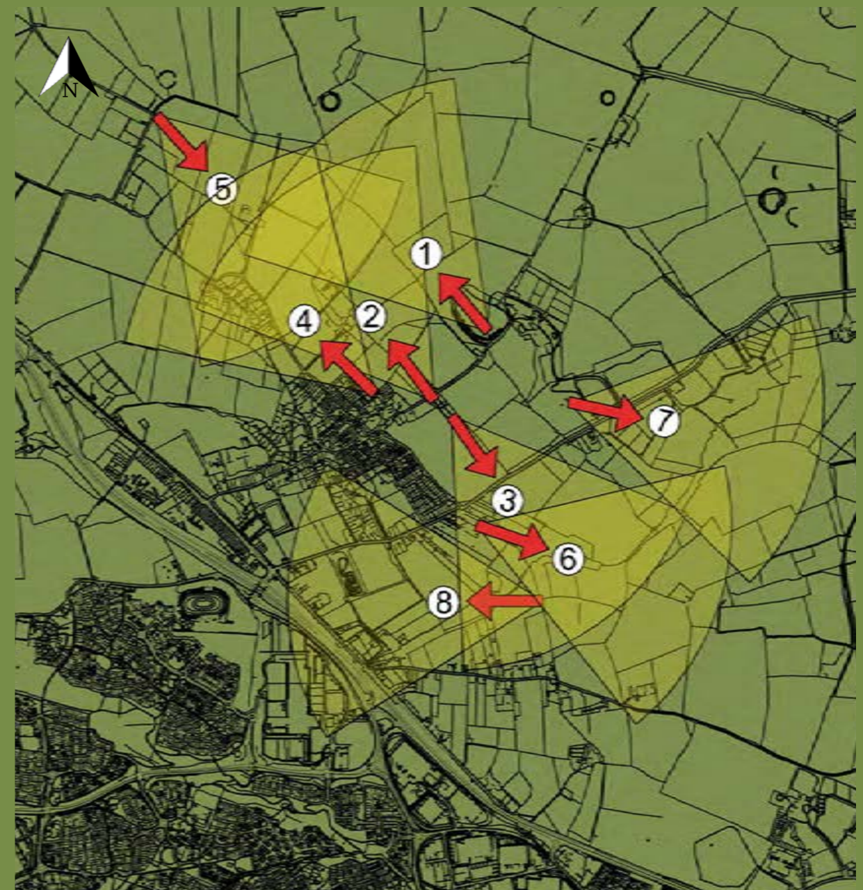
FIG 14 IMPORTANT VIEW POINTS