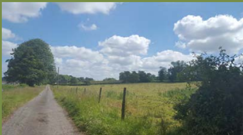
FIG 3 VIEW TO OXLEAZE FARM