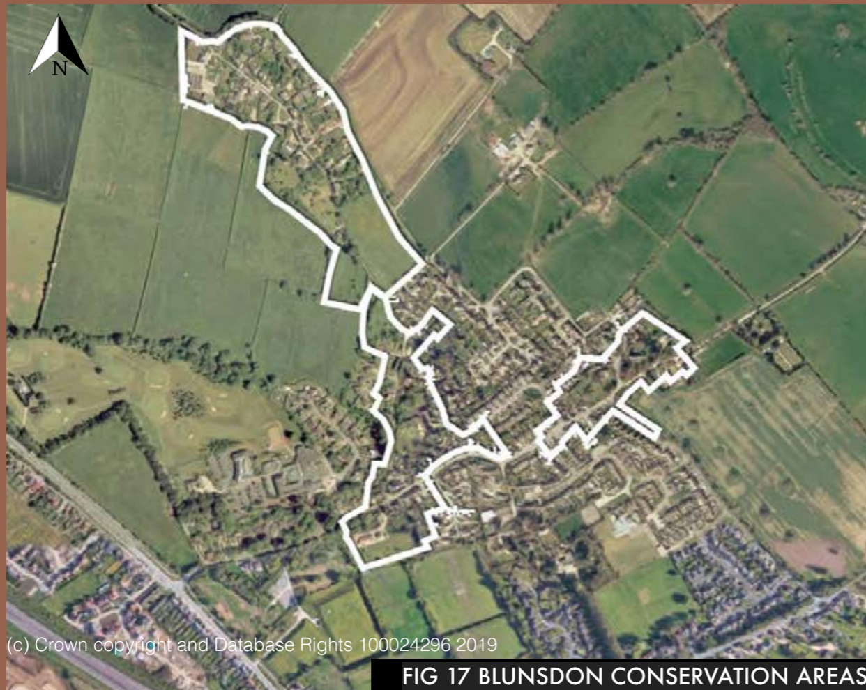
FIG 17 BLUNSDON CONSERVATION AREAS

Matches to local materials, should be used to build the traditional architecture and spaces, enhancing its use in the new design. It should reach a balance between the mixed historic essences of the built environment, yet be in keeping with its surroundings.