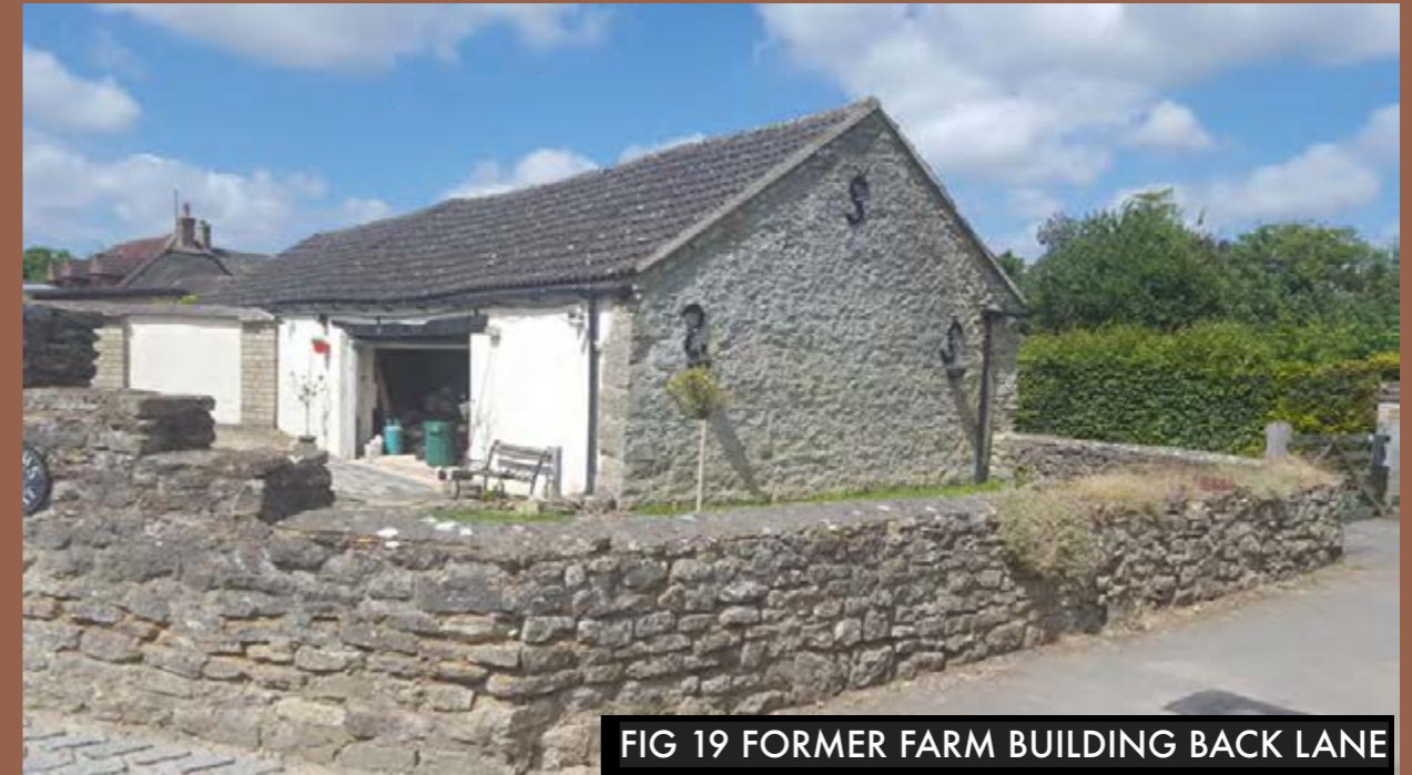
FIG 19 FORMER FARM BUILDING BACK LANE

When considering proposals for appropriate development within BENP, the use of simple, rural building forms will be encouraged.