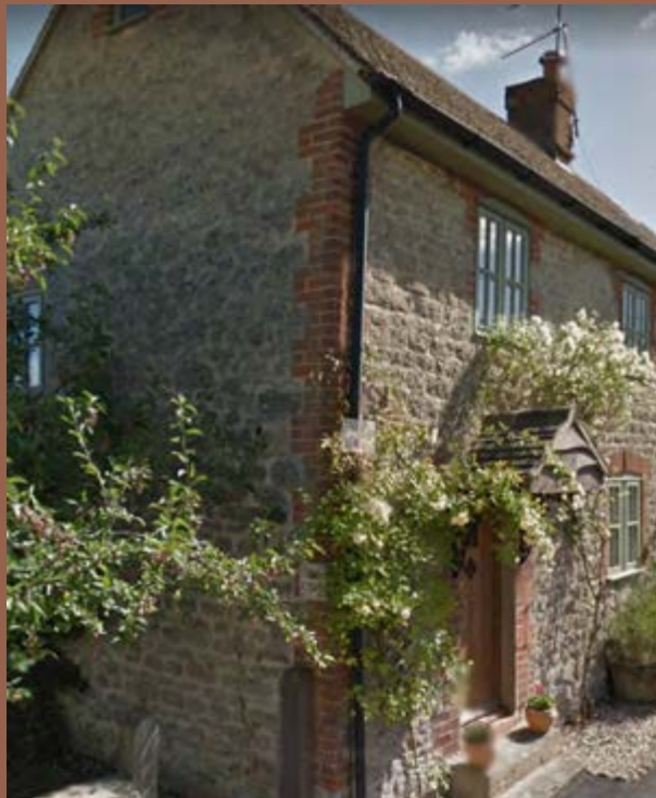
FIG 23 SIMPLE PORCHES

Full details of these common details are encouraged to be outlined where they are proposed so that the intended design and style may be assessed and advice given.