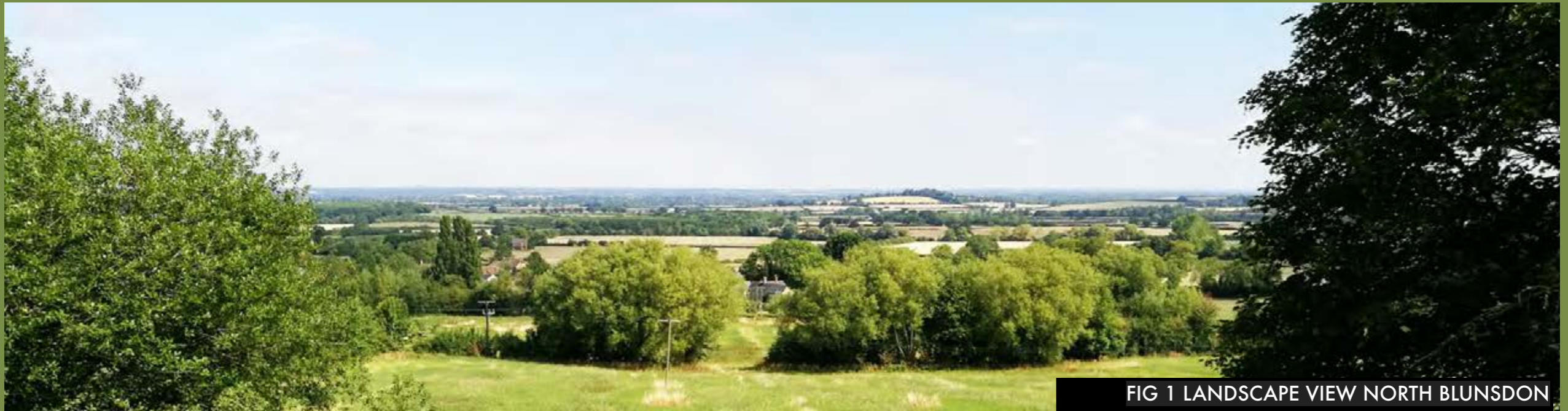
FIG 1 LANDSCAPE VIEW NORTH BLUNSDON