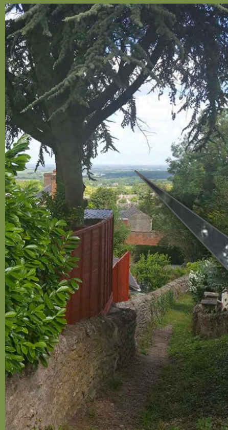
FIG12 VIEW FROM HIGH ST

3.17. Northwards , there are some exceptional panoramic views over the Thames valley towards the Cotswolds, and back inwards towards the village (FIG 14).