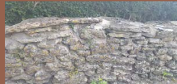
FIG 26 STONE WALLS

Hedges to the front and side boundaries are of indigenous planting especially holly, beech, hornbeam and hawthorn. Low Front boundary walls are stone or brick with timber or cast iron gates.