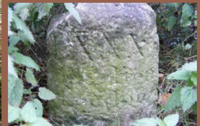
FIG 29 STREET FEATURES