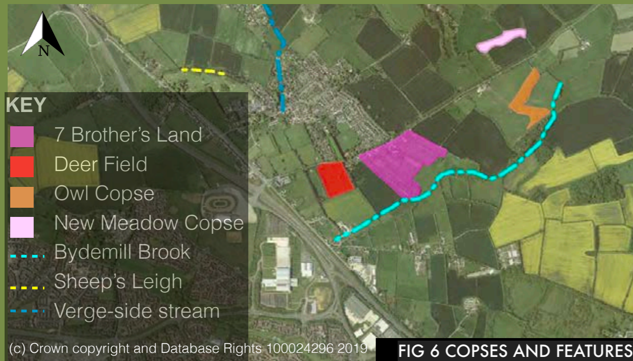
FIG 6 COPSES AND FEATURES

Wet woodlands like those alongside of the tributary of the Bydemill Brook forming stream corridors are to be retained where possible. We will resist the drainage of wet woodlands associated with stream corridors.