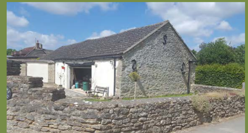
FIG 5 HISTORIC FARM BUILDING