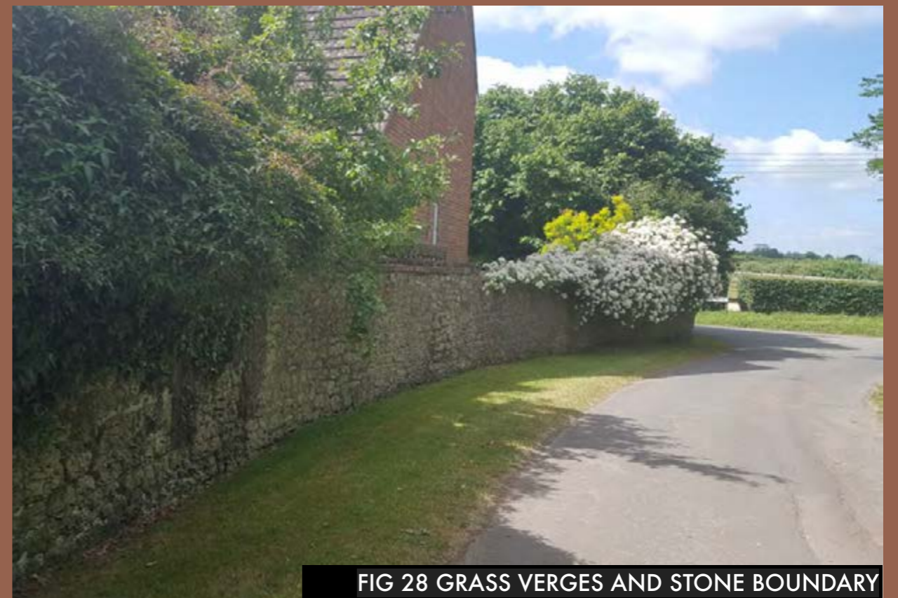
FIG 28 GRASS VERGES AND STONE BOUNDARY