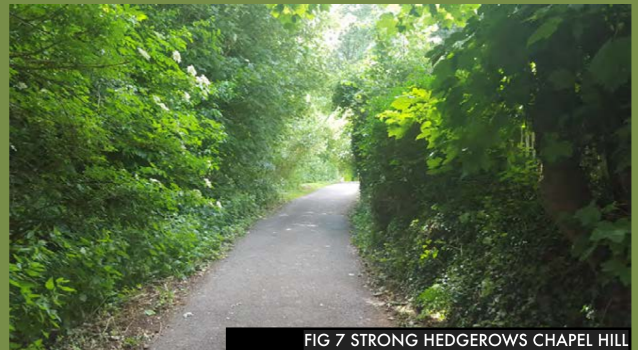
FIG 7 STRONG HEDGEROWS CHAPEL HILL

The retention of existing in-field trees and hedgerows will be encouraged including, (where appropriate) the creation and enhancement of native woodland. This is subject to the applicant ensuring that key views and glimpses are not lost.