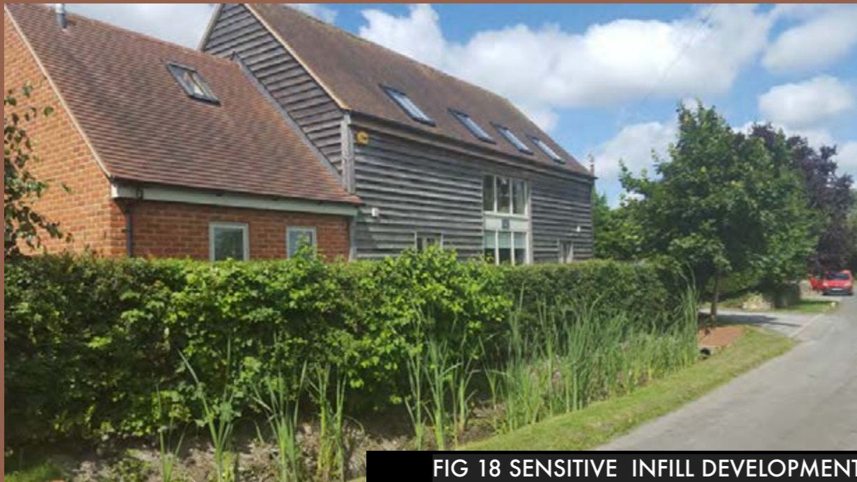
FIG 18 SENSITIVE INFILL DEVELOPMENT

Extensions or alterations to buildings of architectural merit should be discreetly or sensitively positioned.