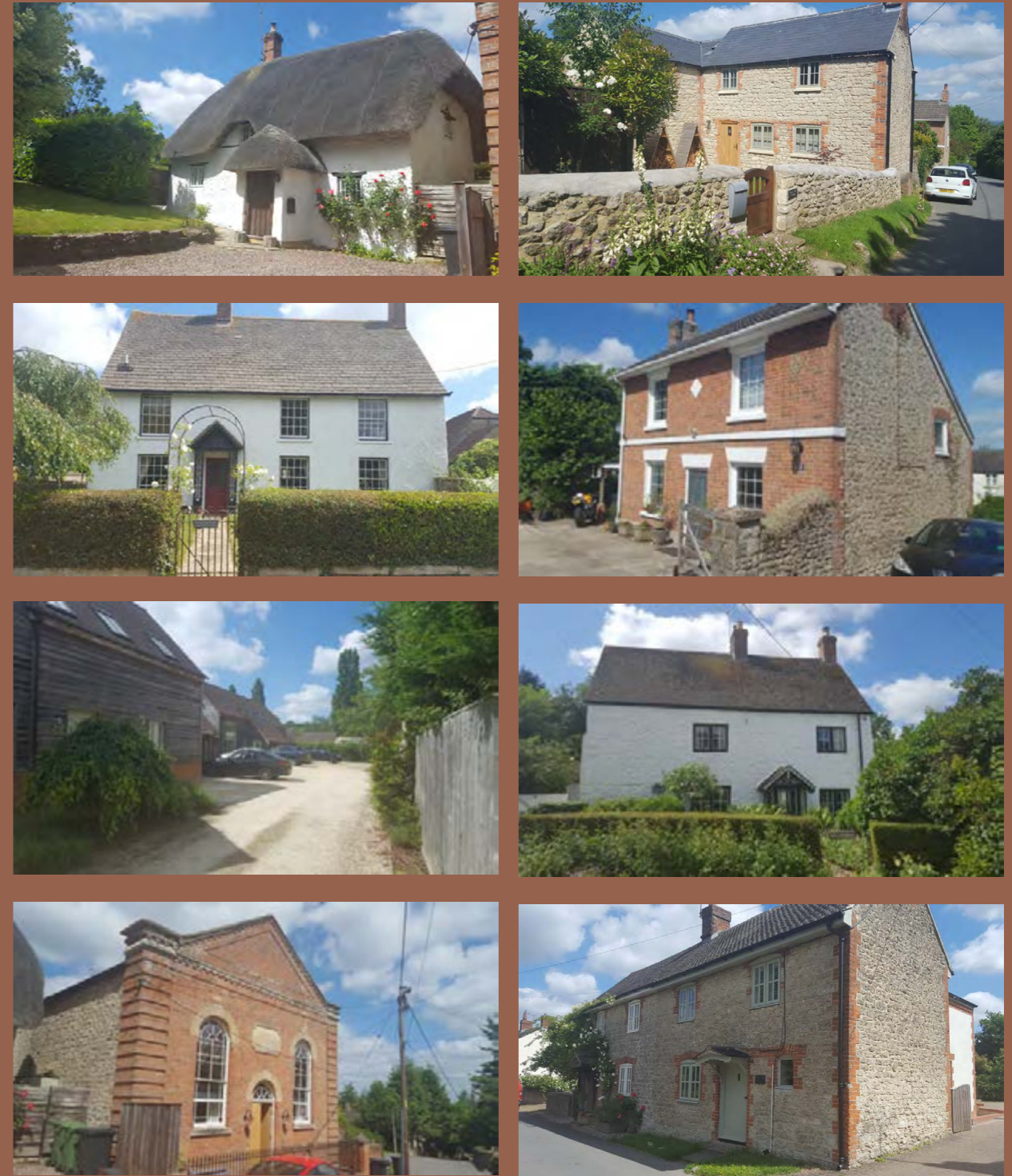
FIG 20 MONTAGE OF PROPERTIES OF BRICK, STONE, RENDER AND TIMBER

The use of materials, methods and technologies that reduce the carbon footprint of buildings are welcomed. All new houses should be encouraged to use more than one green technology including the use of grey water recycling.