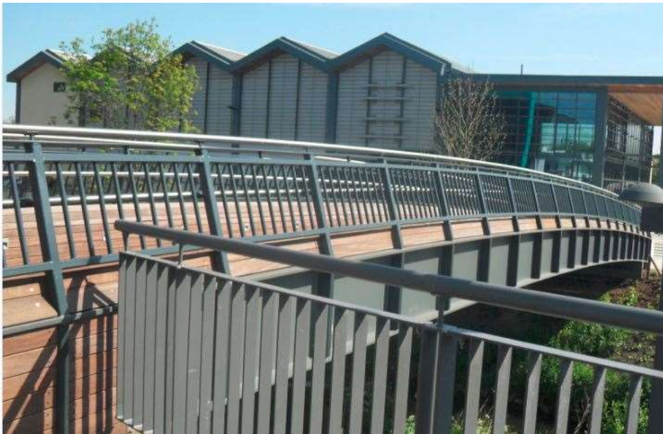
Steel/timber pedestrian bridge, Trowbridge