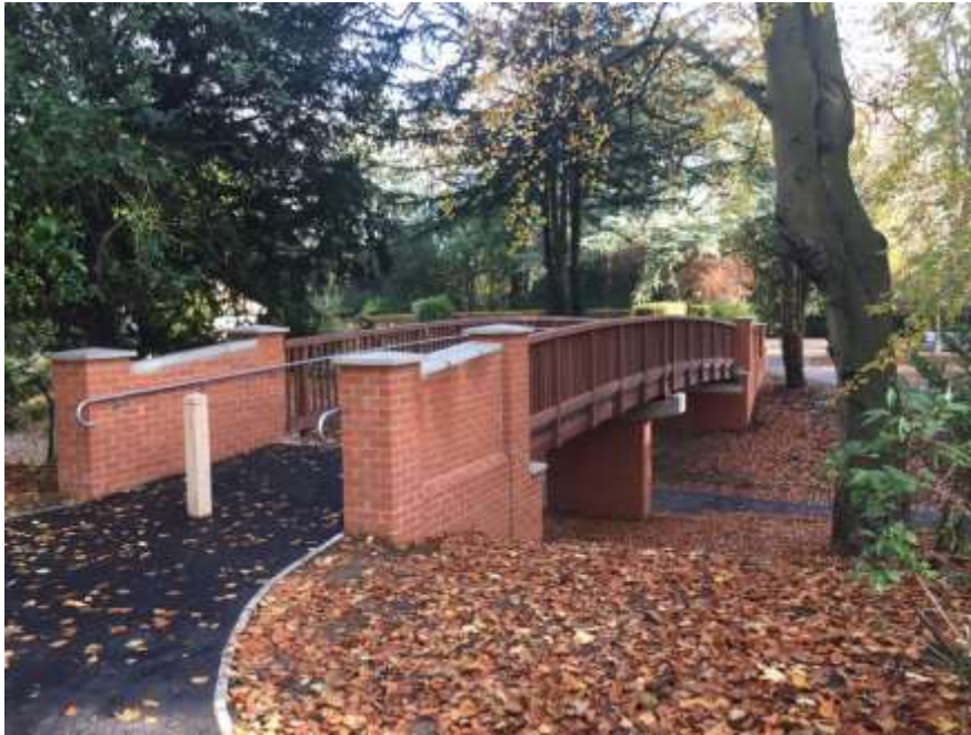
Timber/brick pedestrian/cycleway structure, Swindon