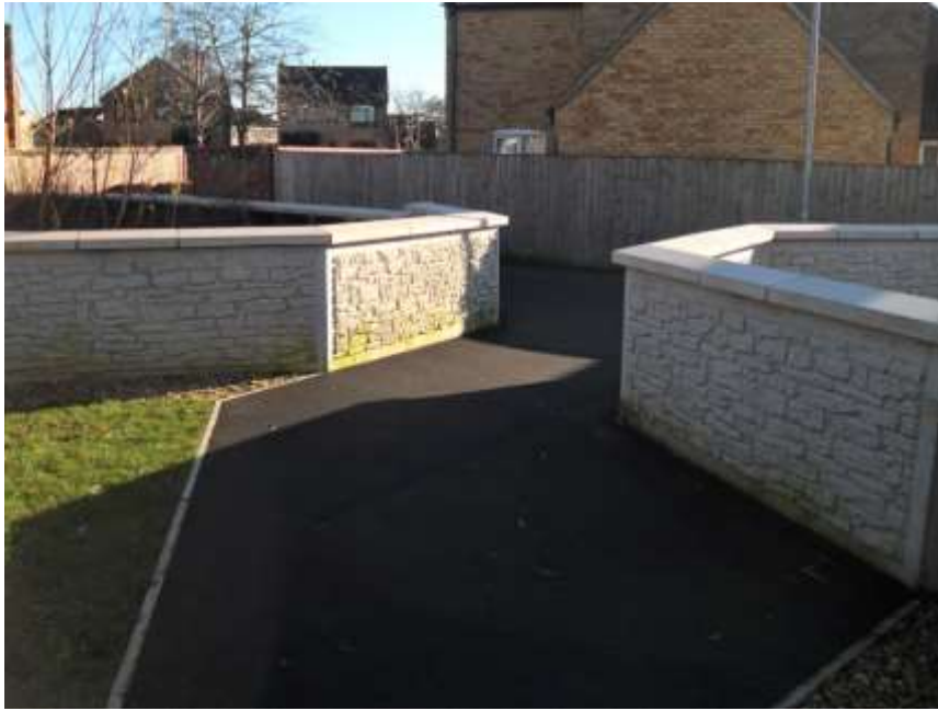
Stone wall effect, Swindon