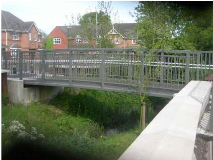
Steel pedestrian/cycleway structure, Swindon (Image reference: Swindon Borough Council)