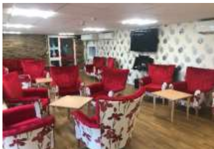
Newburgh House - Communal Lounge