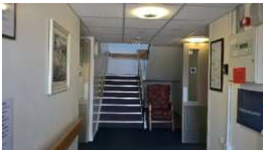
Gladys Plumey Gardens