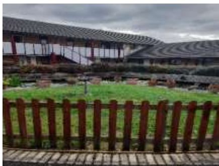
George Selman Gardens