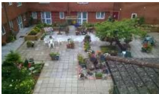
Peter Furkins Court Communal Garden