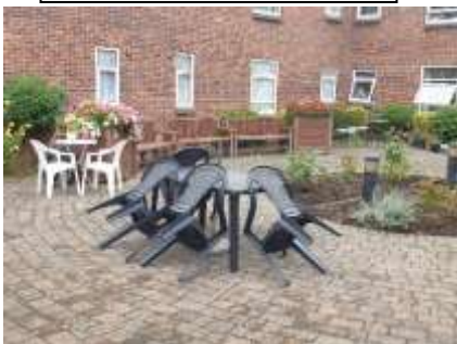
Dr Behr Court - Communal Garden