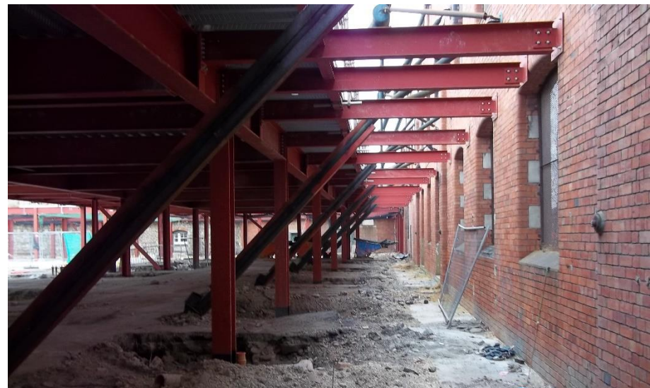
FIGURE 1 Restoration of former Railway Works, Swindon

In the past, these types of industrial activities have often resulted in contamination of the land.