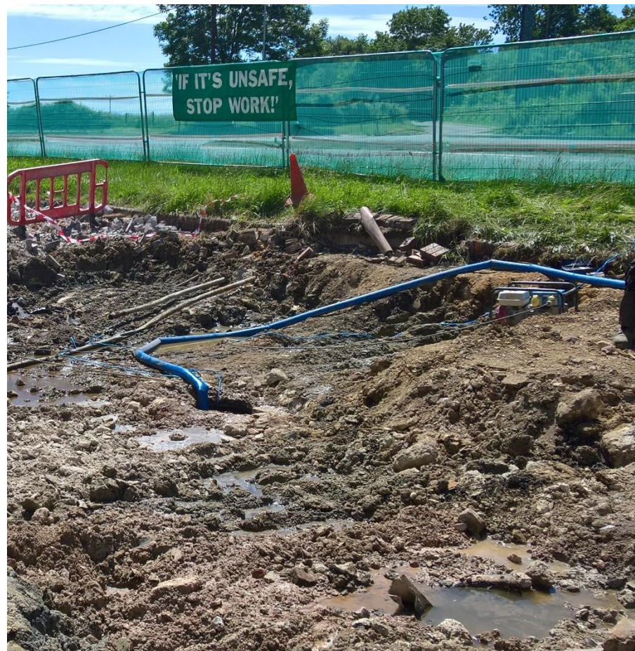
FIGURE 3 Contaminated groundwater removal from a disused chamber

contamination risks, the LPA recommends that the principles of sustainable remediation be followed as far as possible. The approach to sustainable remediation is described in ISO 18504:2017 and the principles and best practice are promoted by SuRF-UK: Link to SuRF-UK Sustainable Remediation Forum