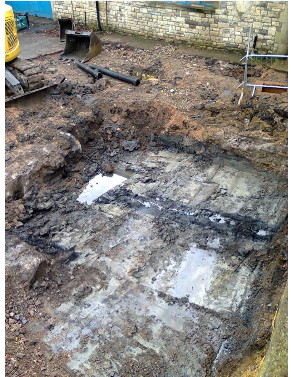
FIGURE 2 Fuel contamination discovered at an industrial site

The developer can apply for discharge of a contaminated land condition once the requirements of the condition have been met. This might include the completion of site investigations or the approved remediation works. The Local Planning Authority would need to receive from the developer appropriate reports that demonstrate the risks from land contamination to the health of future users and the local environment have been addressed. This should be submitted to the Local Planning Authority accompanied by the appropriate condition discharge application forms and fee. For this process to be valid, developers should submit complete reports, including all appendices and accompanying data directly to the Planning Case Officer and not to the Contaminated Land Officer, except as a copy.