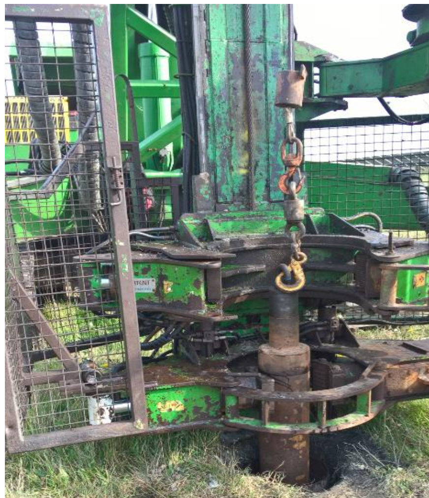
FIGURE 4 Borehole drilling within old landfilled wastes

additional development costs, so it is important for all the developer's team to be aware of this and national contaminated land guidance.