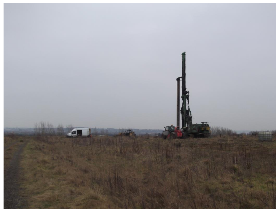
FIGURE 5 Rotary drilling of borehole within waste materials

Reuse of material within larger development in particular may result in fewer lorry journeys to/from the site and thus in lower carbon emissions, helping to minimise contributions to climate change.