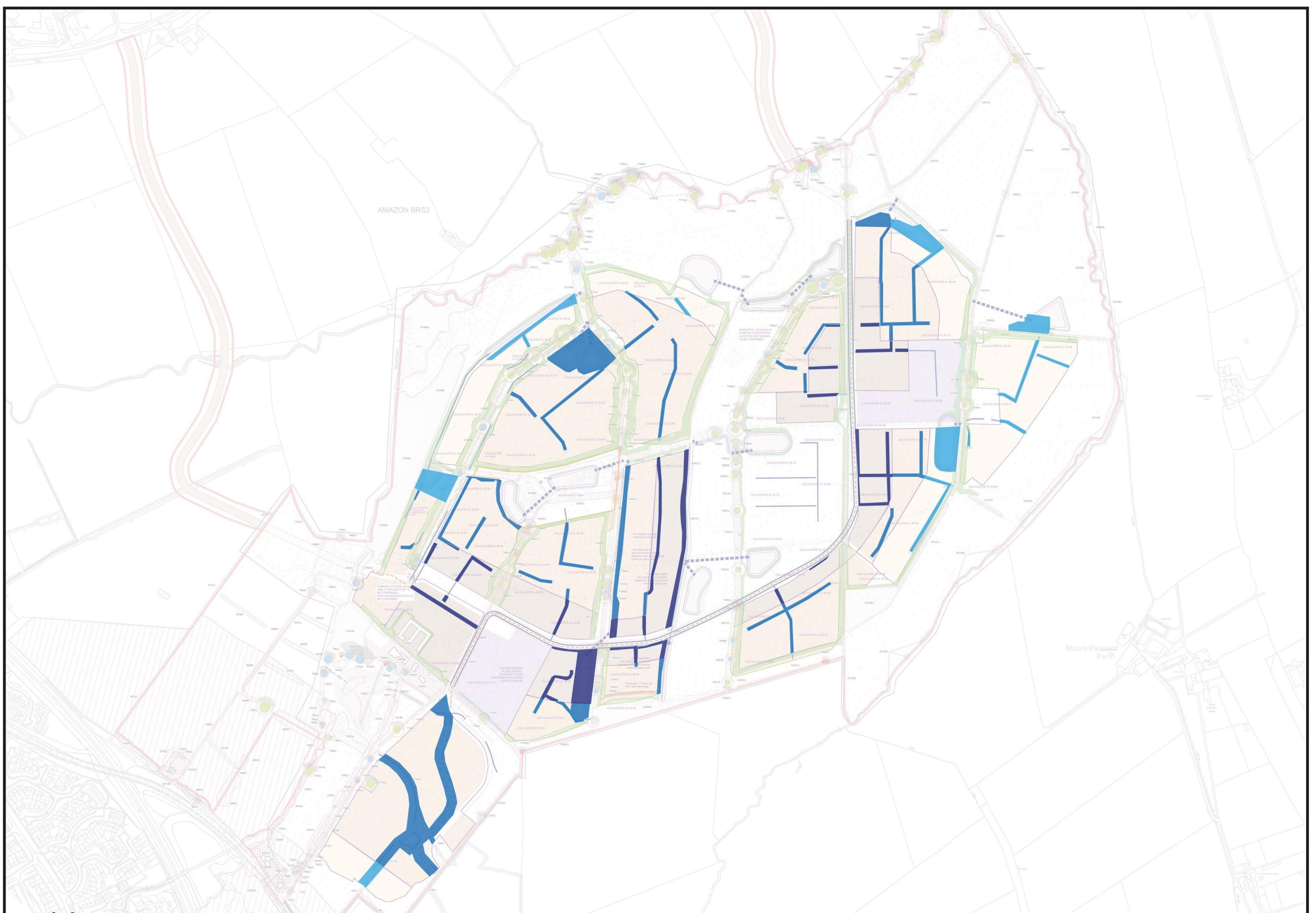
Table C: Dwelling loss - Original FRA Addendum