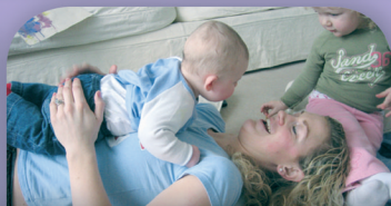
We can all have fun on the floor...