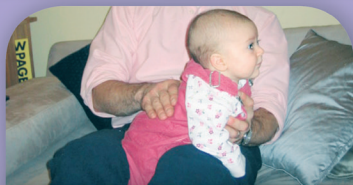
Look how far I can see...