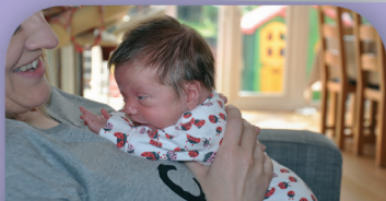
We love our cuddle time