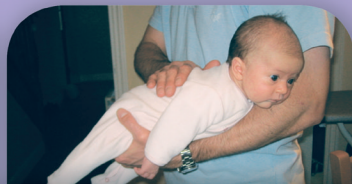
Flying starts young