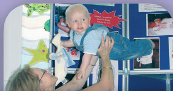
Look how strong I am now