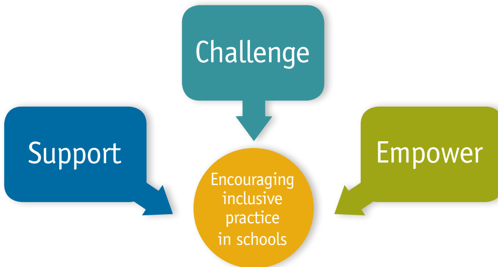
Figure 3: The local authority role in encouraging inclusive practice in schools

Local authorities have a role in facilitating inclusive practice in mainstream schools. The research suggested that there are three aspects to the role: providing schools with support that enables them to effectively include children with SEND; challenging schools to ensure that they are taking responsibility for offering appropriate provision; and empowering schools to respond flexibly to children's needs. These are shown in Figure 3.